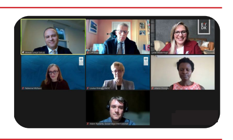
Investment Office took part in the "Developing Partnerships and Increasing Capacities between Türkiye-UK for Impact Investing" panel, organized by UNDP Türkiye, and shared insights into Turkish impact investment ecosystem.

Investment Office attended the "Electric Vehicles and Energy Sector" session of the "Türkiye Energy Forum 2022" that addressed the opportunities, trends, and challenges of the Turkish EV market, as well as e-mobility integration, financing Türkiye's transition to EV, battery technology, and electric transportation.