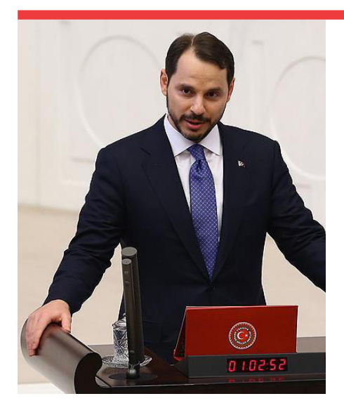
Berat Albayrak Treasury and Finance Minister